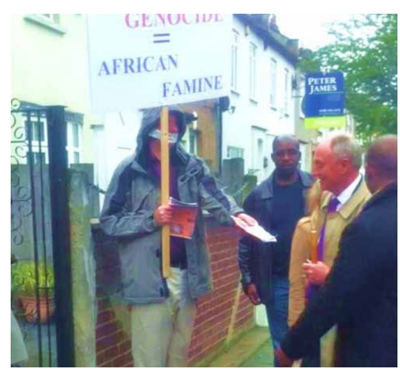
South African exiles claim to be racially abused at Freedom Day event in London.

Grensvegter: This is the misconception that lies at the heart of our problems. Neither Old Mutual or Anglo American, De Beers or SAB Miller (all top 5 SA companies and Fortune 500 companies) are in the hands of any South African, white or black. It was the price the ANC paid to the UK and US to get into power. It is a fruitless act to nationalise the mines, when the mineral rights belong to foreigners. As to the farm attacks, they are more than political attacks, they are racially motivated as part of an ethnic cleansing process because the Boers are the biggest threat to Zulu supremacy. Know this, that