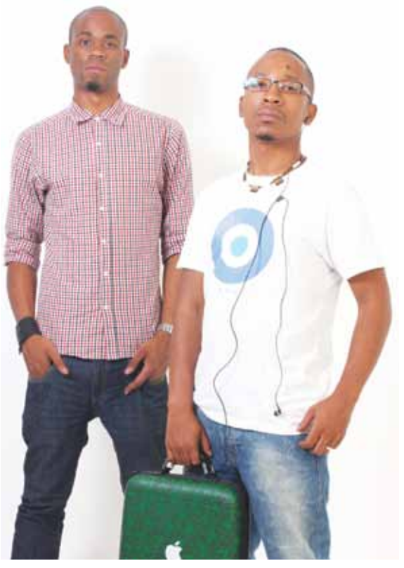
SA MUSIC EXPLOSION: We've got five pairs of tickets up for grabs to watch Prime Circle and a bunch of other cool bands at Homelanz festival in London on 16 June 2012. You could also win tickets to see South African house music duo Liquideep as the guest DJs at Brixton Club House on Saturday 19 May. Liquideep will perform a live PA of all their hits including 'Fairytale', which earned them a SAMA nomination and numerous awards. Enter these competitions and many others on www.thesouthafrican.com/win